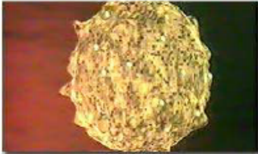
HIV attacks the immune system's helper T cells.